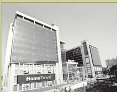
247Park, Vikhroli - Mumbai IT Park

Realised 21% IRR Exit Value INR 607 crores