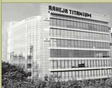
Raheja Titanium - Mumbai Commercial Office

Realised 29% IRR Exit Value INR 60 crores