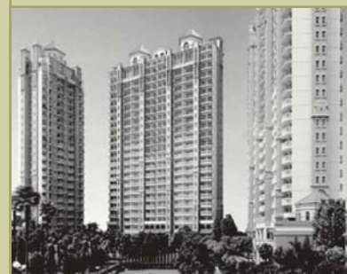
ATS Dolce, Greater Noida - NCR Mid - Income Housing Complex

Realised 23% IRR* (Tranche 1) Exit Value INR 84 crores