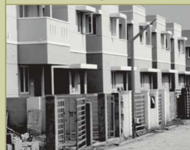
Pelican Belfort - Pondicherry Senior Living Villaments

Realised 25% IRR Exit Value INR 37 crores