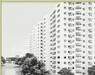
Godrej Prakriti - Kolkata Integrated Township

Realised 20% IRR Exit Value INR 200 crores